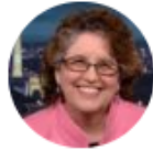
Ellen Weintraub Federal Election Commission Vice-Chair (Incoming)