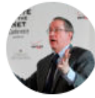
Rep. Bob Goodlatte Chairman House Judiciary Committee