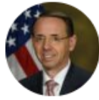
Rod Rosenstein Deputy Assistant Attorney General U.S. Department of Justice