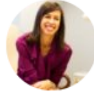
Jessica Rosenworcel Commissioner Federal Communications Commission