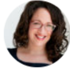
Amy Webb Future Today Institute Futurist and Author