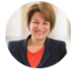
Sen. Amy Klobuchar Senator United States Senate