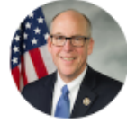
Rep. Greg Walden Chairman House Energy & Commerce Committee